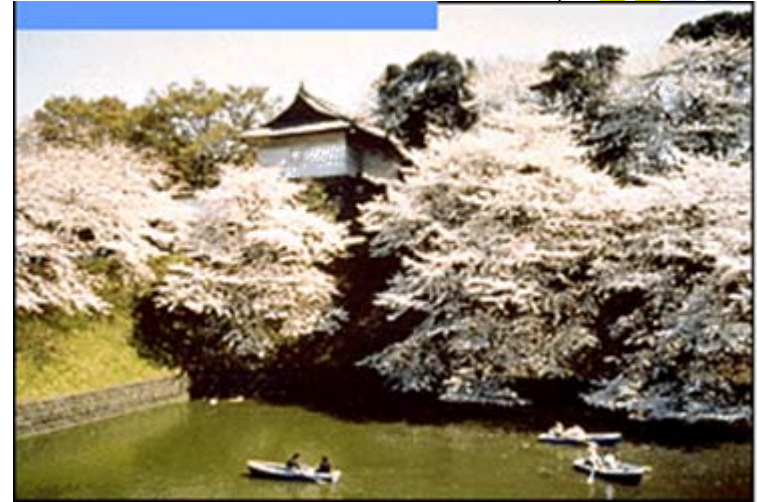
Cherry blossoms, Imperial Palace

"Based on the INC Vision and the previous INC discussions, INC4 also discusses the issues in nanotechnology area such as the electronics, bio, materials, MEMS/NEMS, nanophotonics and other fields."